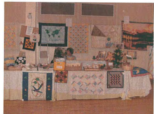
Verity's stall at the 2006 Show

Yes, the offer is again open to all members to sell patchwork 'n' quilting items at our show in September. The arrangement is that WQ takes 10% of the price you ask. I'll try to have a fair share of everyone's goodies on display, rotating if necessary to give everyone a chance. Not only can you sell patchwork and quilting goods but books and accessories (in good condition) always sell well.